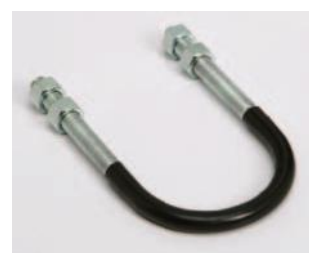
B3188C Plastic Coated