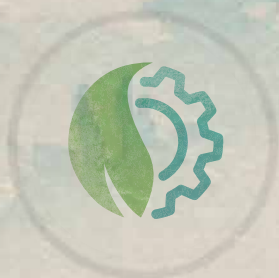
Degrees of Innovation

Here are our bold commitments towards Sustainability.